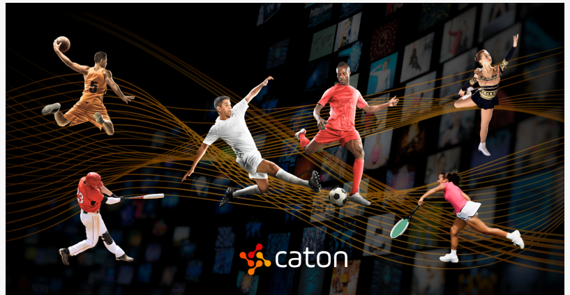
Caton Media XStream - Revolutionary IP Broadcast Solution Powered By AI