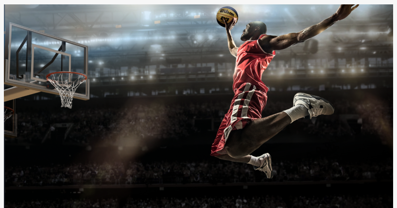
Caton Technology - DAZN FIBA 3X3

SINGAPORE, SINGAPORE, July 23, 2024 /EINPresswire.com/ -- Caton Technology is proud to announce that it has been selected by DAZN , the leading global sports streaming platform, to provide a comprehensive IP transport solution for FIBA 3X3 World Tour 2024 broadcasts in Taiwan. This collaboration addresses critical challenges faced by DAZN in delivering high-quality sports video from Romania and Hong Kong to Taiwan.