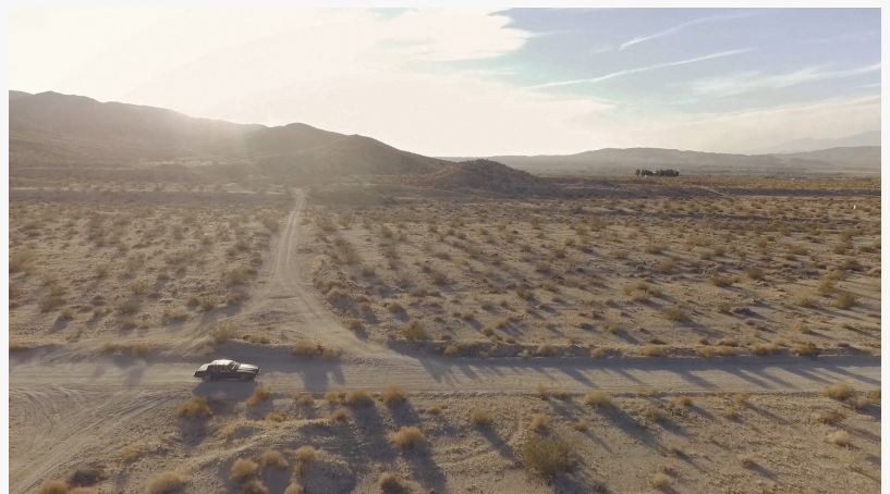
In The Remote Arizona Desert, EDDIE. Image 3