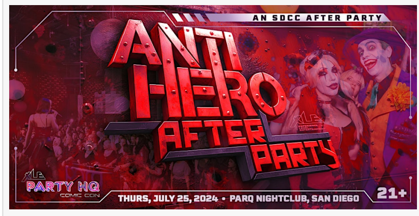
AntiHero After Party, SDCC Thursday Night!

Clothing, M2-P2, Comic Con Radio, Virtual Cantina, Govee, SHP Comics, Redination, and Pauma Casino.