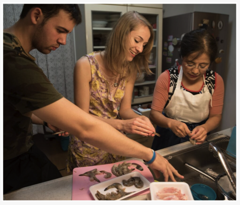
3. HOST YOUR COOKING EXPERIENCE WITH GUESTS

You have the option of accepting or refusing booking requests. If you accept a booking request, the booking will be confirmed.