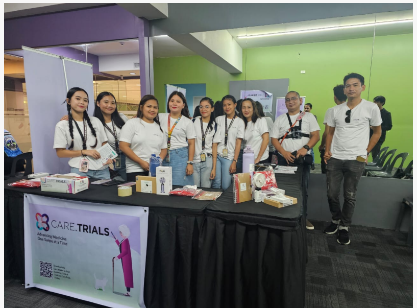
The Care.Trials Team in full force supporting the blood donation drive