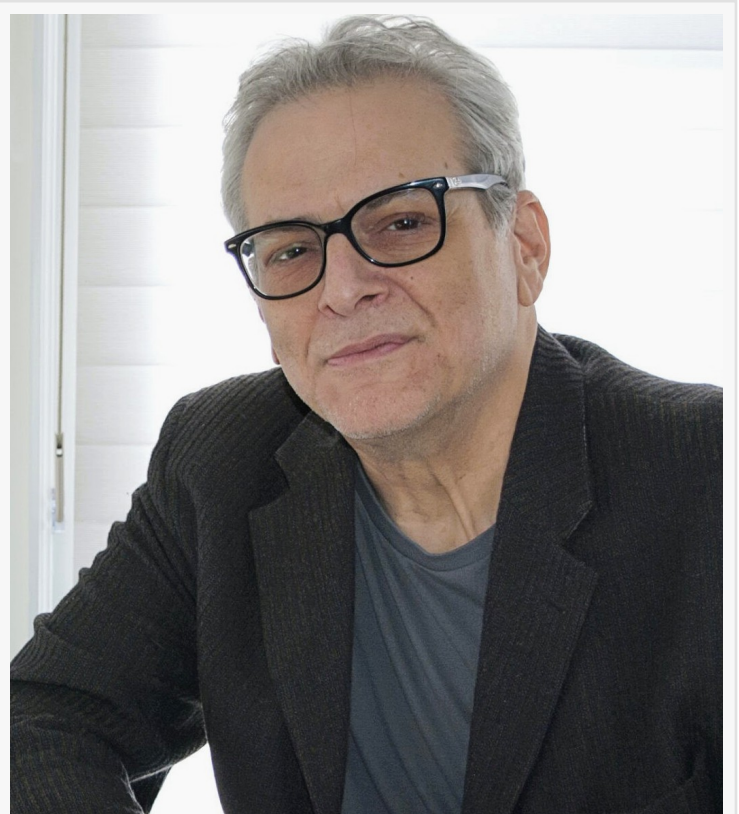
Richard Behar, author of "Madoff: The Final Word"

The journalist's extensive research included reviewing over 100,000 pages of documents and interviewing more than 300 sources, including federal regulators, prosecutors, and SEC agents.