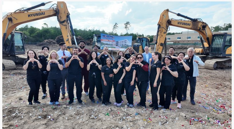
Ground Breaking Ceremony - Modern Heart and Vascular

This press release can be viewed online at: https://www.einpresswire.com/article/729331599