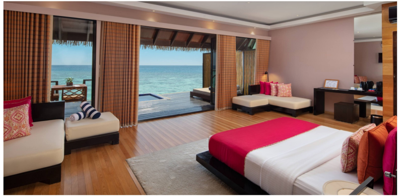
A Sunset Water Villa