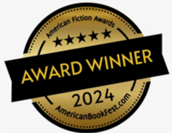
Winner of the 2024 American Fiction Awards Category: Horror Occult