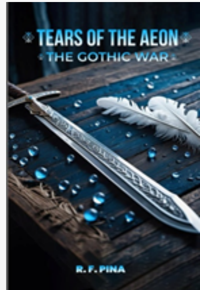
Tears of the Aeon: The Gothic War