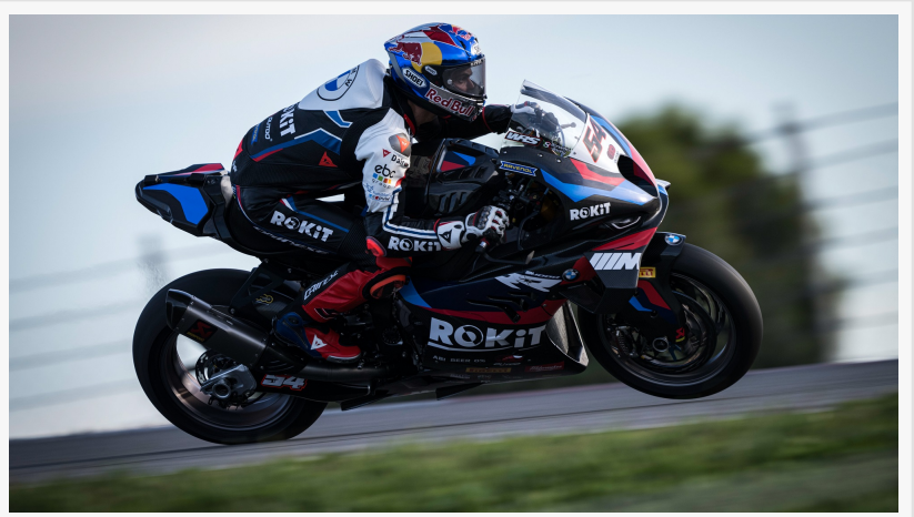
Flat our with Toprak

This press release can be viewed online at: https://www.einpresswire.com/article/729462770