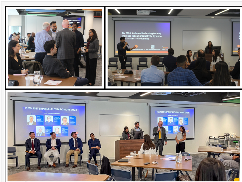
DSW Enterprise AI Symposium 2024 in Dublin - A Success!

The symposium provided a platform for AI professionals, to celebrate their dedication and contributions to driving innovation in Ireland. Participants engaged in networking sessions,