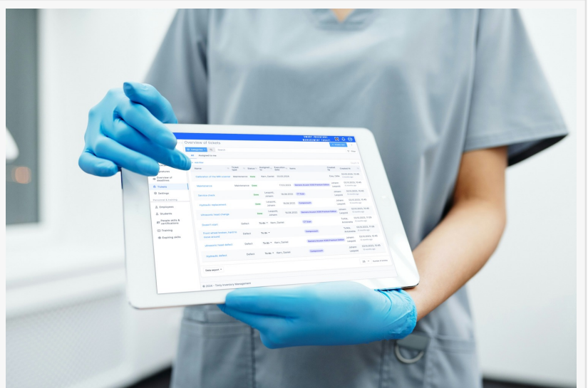
Bayer Using Timly Asset Tracking Software on Mobile Devices

ZÜRICH, ZH, SWITZERLAND, July 22, 2024 /EINPresswire.com/ -- Bayer Germany has chosen Timly for managing assets and related maintenance in their lab reactors. With Timly's cloud-based web app and smart QR technology, Bayer has found a powerful asset management solution that is intuitive and offers anytime, anywhere access.