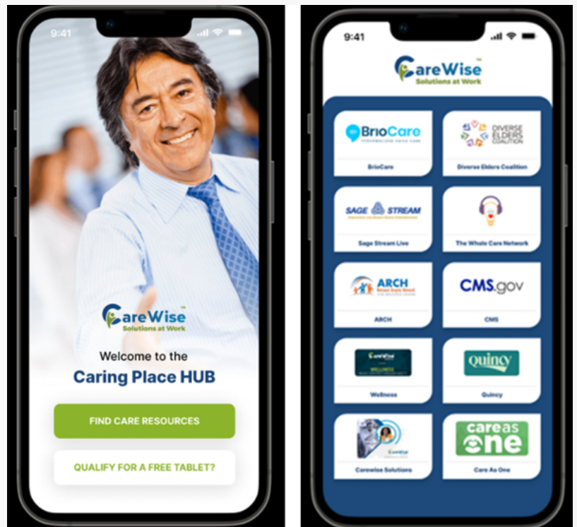
The Caring Place HUB App