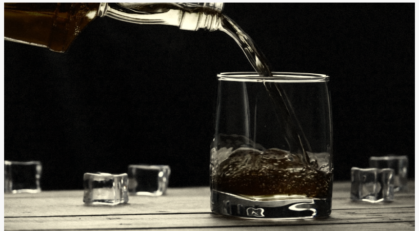
Desert Diamond Distillery Rum