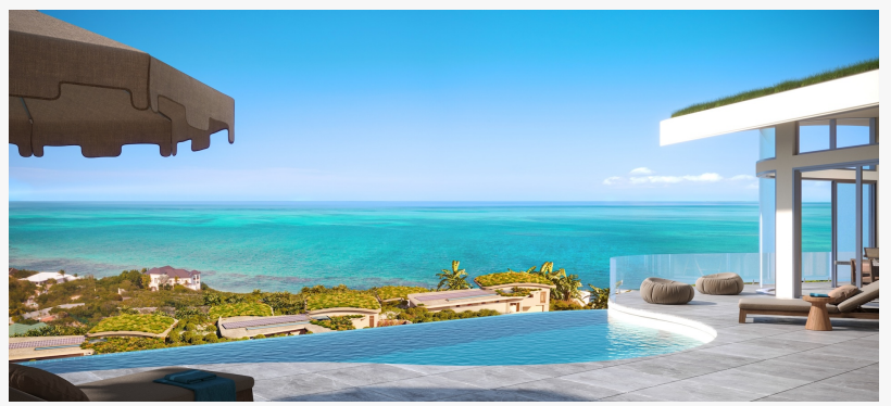
The Pool at Villa Five

for eco-friendly, sustainable development in TCI by providing each of its new luxury villas with a Living Green Roof.