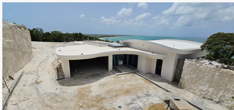
Construction at The Summit

This press release can be viewed online at: https://www.einpresswire.com/article/729562666