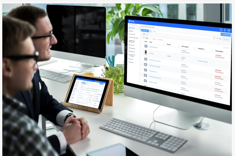
Cobus Employees Using the Inventory Management App Timly on a Laptop and a Tablet

IT assets and networks. Recognizing this need, Cobus Systems opted for the powerful integration of Lansweeper and Timly to transform their IT asset management processes.