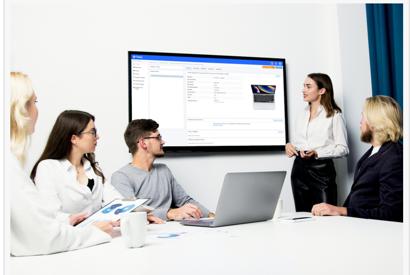
Timly asset management software in every office