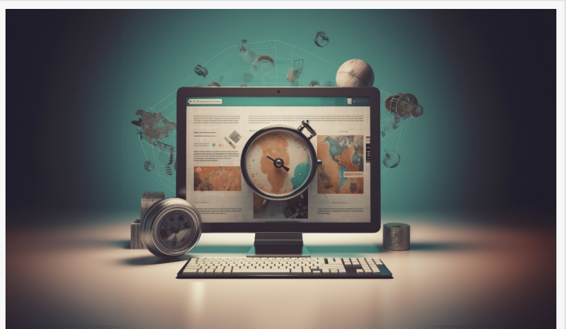
Lounge Lizard Unveils Proven SEO Strategies to Boost Business Visibility