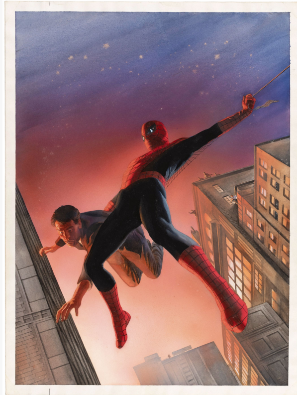
Alex Ross original art for 'Hero Illustrated' #6, published December 1993, recreating Jack Kirby's Spider-Man cover for 'Amazing Fantasy' #15. Size: 15in x 20in on artpaper. Provenance: Gary and Dawn Guzzo collection. Open estimate

A most unusual hybrid sample and card combines a figure of Princess Leia Organa (Boussh Disguise) and a 1982 Star Wars: The Empire Strikes Back Boba Fett 48 Back-A card. This particular mash-up was created to give a general idea of how the Leia figure would look on a blister card before an