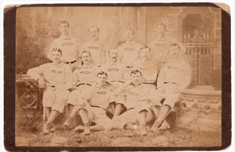
Only known cabinet card depicting all 11 team members of 1881 Troy (NY) Trojans National League baseball team, including four future National Baseball Hall of Famers: Buck Ewing, Roger Connor, Tim Keefe and Mickey Welch. Estimate: $20,000-$35,000