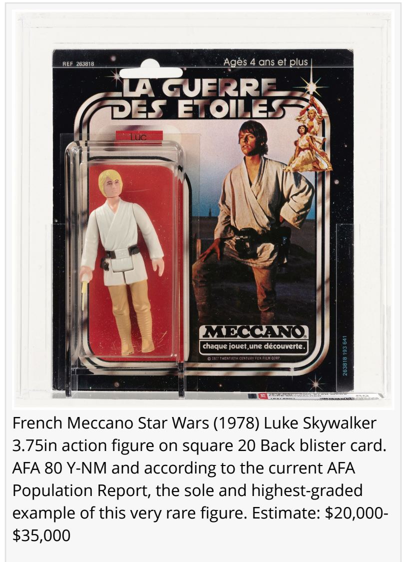
French Meccano Star Wars (1978) Luke Skywalker 3.75in action figure on square 20 Back blister card. AFA 80 Y-NM and according to the current AFA Population Report, the sole and highest-graded example of this very rare figure. Estimate: $20,000-$35,000

Also poised for success is Walt Simonson's original pen-and-ink art for the cover of Shadow Cabinet #0, published by DC Comics as part of their Milestone Comics imprint in January 1994. This issue marks the first appearance of the Shadow Cabinet, with the cover showing members Hardware, Xombi, Iron Butterfly, Icon and Rocket; Static, and Blitzen. Alex Winter observed: "Walt Simonson original art rarely comes to the market, let alone a cover of this magnitude." Signed by Simonson and dated 7-15-93 at its lower left, the 14- by 16.75-inch artwork is expected to sell