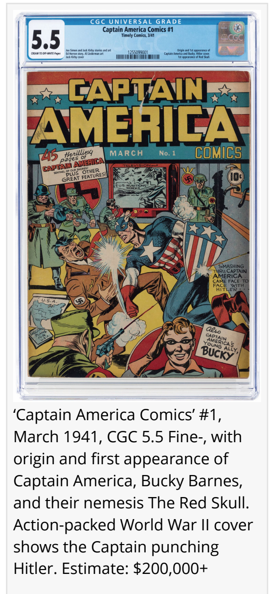
'Captain America Comics' #1, March 1941, CGC 5.5 Fine-, with origin and first appearance of Captain America, Bucky Barnes, and their nemesis The Red Skull. Action-packed World War II cover shows the Captain punching Hitler. Estimate: $200,000+