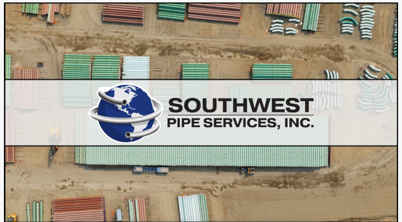
Southwest Pipe Services Pipe Yards in Kansas and Alvin