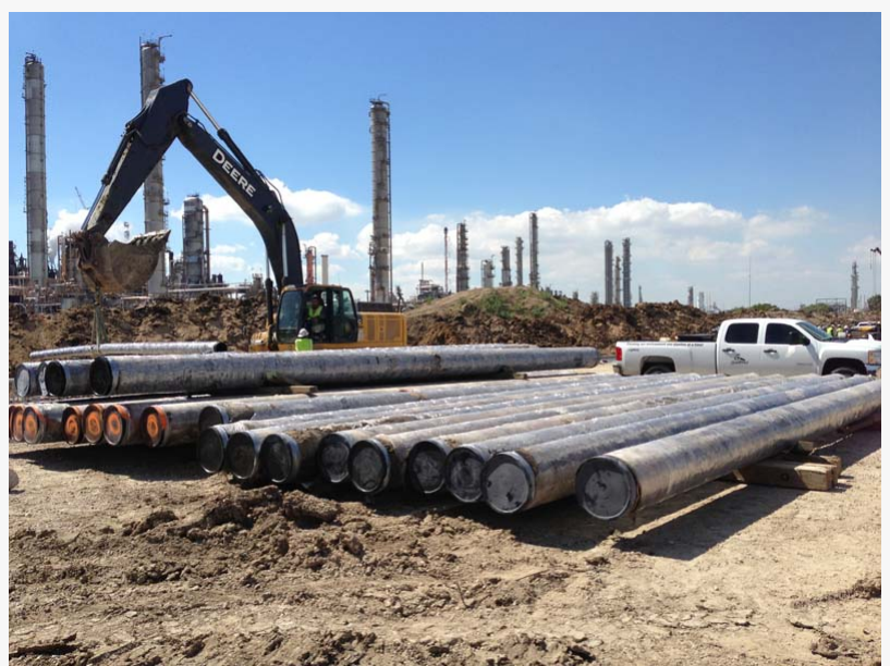
Southwest Pipe Services Inc Environmental Services for Pipeline Abatement

Southwest Pipe Services, Inc. (SWP) is an environmental pipeline service company specializing in the mechanical removal of pipe coatings. Their services are performed for clients in the oil and gas, petrochemical, and energy industries. The company handles regulated waste removal, such as asbestos (ACM) and Polychlorinated Biphenyls (PCBs), in compliance with all local, state, and federal regulations.