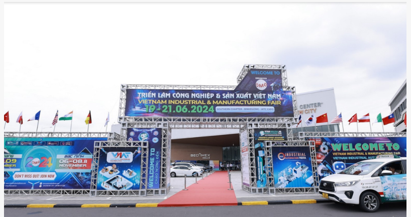
Vietnam Industrial & Manufacturing Fair 2024

Pocket V – a mobile app that increases Epicor Kinetic's flexibility to a new level.