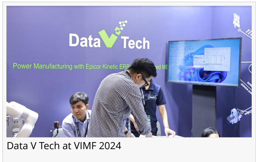
Data V Tech at VIMF 2024

/EINPresswire.com/ -- Data V Tech Solutions Company Ltd. (Data V Tech) excitedly participated in the Vietnam Industrial and Manufacturing Fair - VIMF 2024. This significant event served as a vital meeting point for experts and businesses in the manufacturing and automation industries.