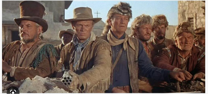
The 1960 John Wayne Alamo Movie

The Alamo Letter Society exists to educate school children, new Texans, and future generations of their forefathers' fight for Liberty, and Freedom, through the placement of a large, bronze plaque containing the Alamo letter at each of the 254 courthouses in the Lone Star State. For more information, visit www.alamoletter.com