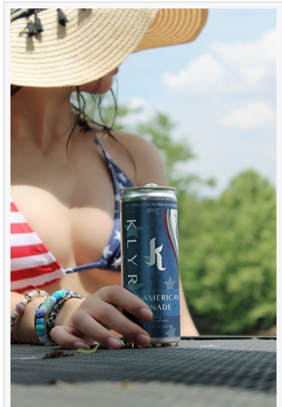
KLYR All-American Lemonade RTD + Female Model

Launched in 2021, KLYR is making waves in the super-premium rum category for its superior non-artificial, quality ingredients and unique hybrid distillation process combining both column and pot stills to craft an incredibly clean and highly versatile spirit. The result is a smooth tasting rum with zero grams of sugar, fewer calories, zero grams of carbohydrates that is non-GMO, gluten-free and Kosher-certified.