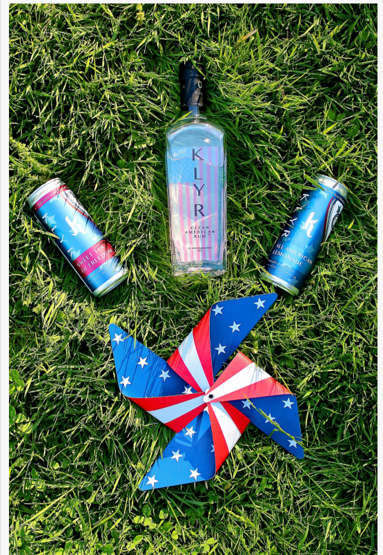
KLYR Rum + All American Lemonade + Sweet Tea of Freedom RTDs Alongside Pinwheel

The burgeoning RTD category has more than tripled since 2018, reaching just over $10 billion in sales last year. The KLYR brand has already entered the spirits-based ready-to-drink space with a variety of flavors in addition to the recently released 'All-American Lemonade' and 'Sweet Tea of Freedom' including: Orange KRUSH, Cucumber + Mint and Tropical Fruit PUNCH among others that are popular with consumers actively searching for all-natural, non-artificial liquid refreshment.