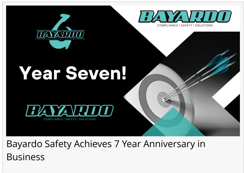
Bayardo Safety Achieves 7 Year Anniversary in Business