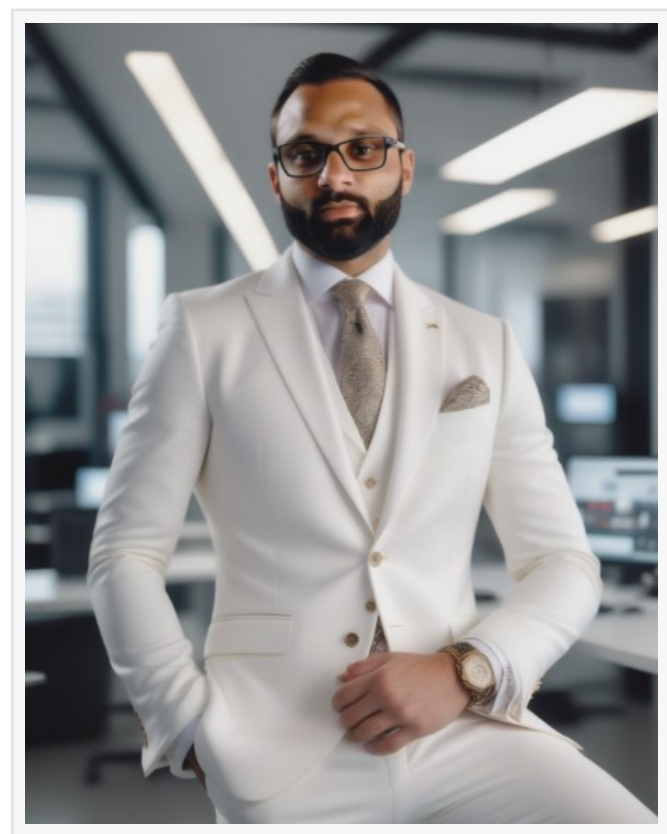
LinkedIn Photo Output2 of Segmind CEO Rohit Ramesh

This press release can be viewed online at: https://www.einpresswire.com/article/729912439