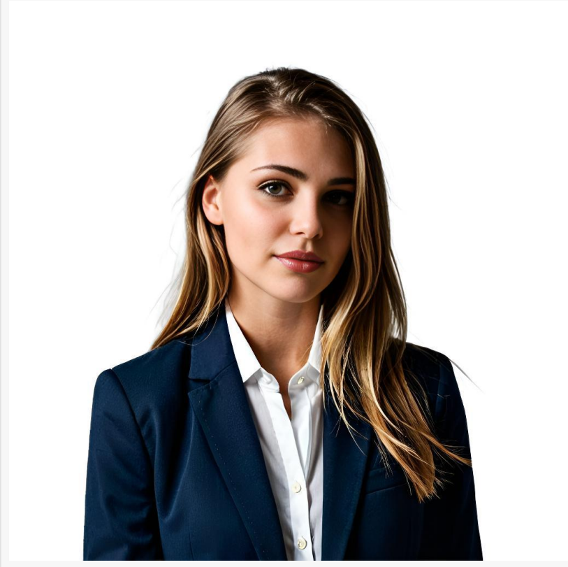
LinkedIn Photo Output of a Model