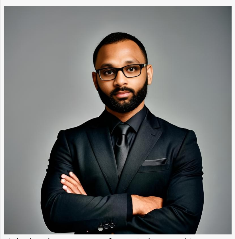
LinkedIn Photo Output of Segmind CEO Rohit Ramesh