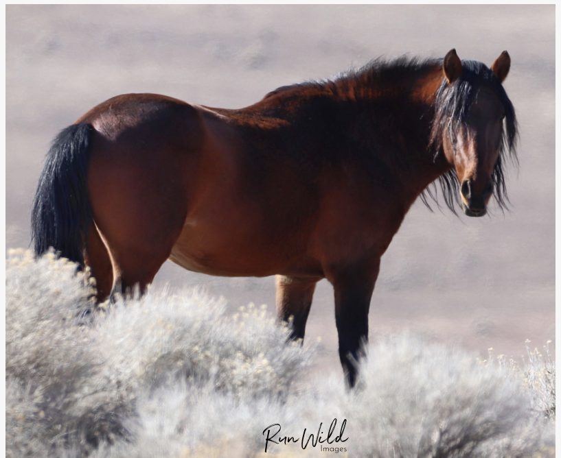
Nevada Wild Horse

Ground temp on a sunny day can run 10-40 degrees higher than air temp