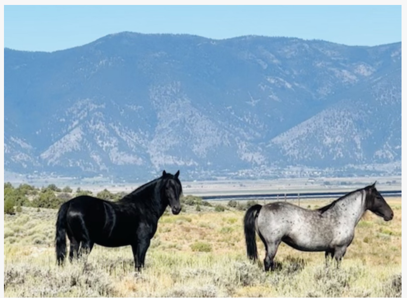
Nevada Wild Horses

COLDEN, NEW YORK, UNITED STATES, July 23, 2024 /EINPresswire.com/ -- The Bureau of Land Management (BLM) was assigned care and protection of America's wild horses and burros(WHB) with 1971's Wild Free Roaming Horse and Burro Act. Since 1971, one half, 26,900,000 acres of land designated as WHB habitat has been stolen and given to ranchers and corporate livestock industries for grazing leases at taxpayer expense. Mining leases, that destroy ecosystems, are given while horses are displaced to taxpayer funded holding.