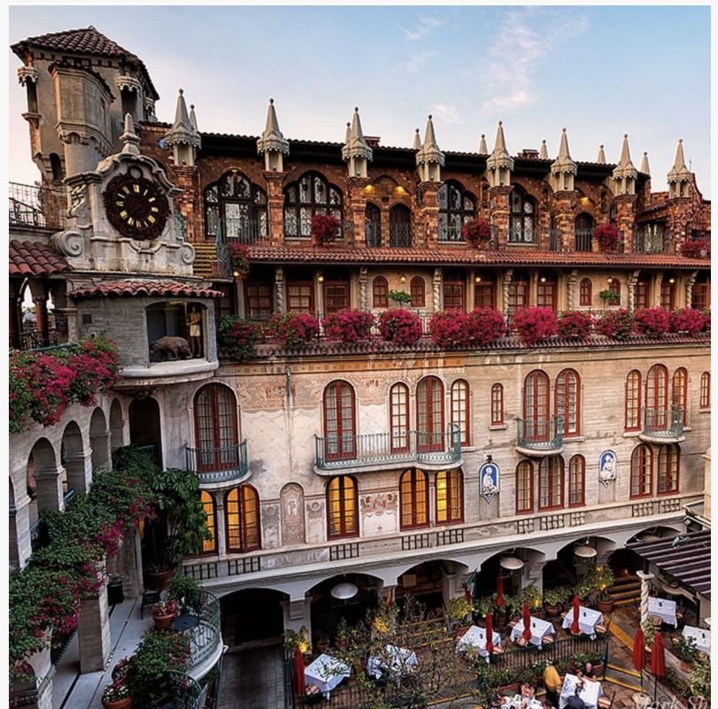
The Historic Mission Inn Hotel & Spa

The Historic Mission Inn Hotel & Spa, a revered landmark in Riverside, California, with exceptional dining experiences at its award-winning restaurants. Each venue is dedicated to providing the finest and freshest ingredients, combined with gracious service, ensuring every