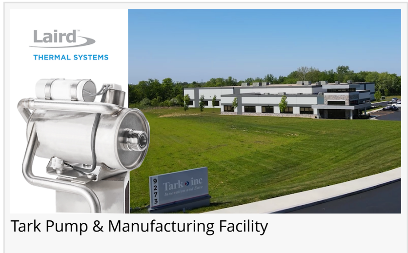
Tark Pump & Manufacturing Facility

DURHAM, NC, USA, July 24, 2024 /EINPresswire.com/ -- Laird Thermal Systems has acquired Tark, Inc. , a US-based supplier of highly specialized pumps and cooling solutions for the medical and industrial CT and X-Ray tube industry. Representatives of Laird Thermal Systems and the company's previous owner signed the contracts in March 2024. With this acquisition, Laird Thermal Systems is strengthening its position as a thermal management solutions leader.