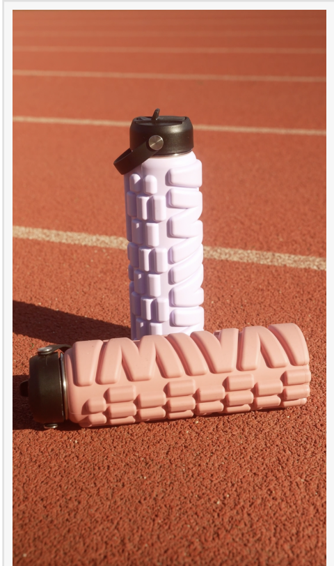
MIVA Recovery, two-in-one solution to hydrating and foam rolling on the running track.

Montaña's commitment to showing the world what a pregnant professional athlete looked like and groundbreaking performances postpartum sparked global conversation, inspiring the #DreamMaternity movement and the evolution of &Mother into the impact non-profit it is today.