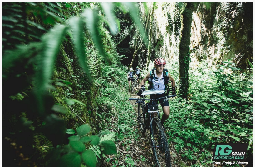
Mountain biking will be part of Gallaecia