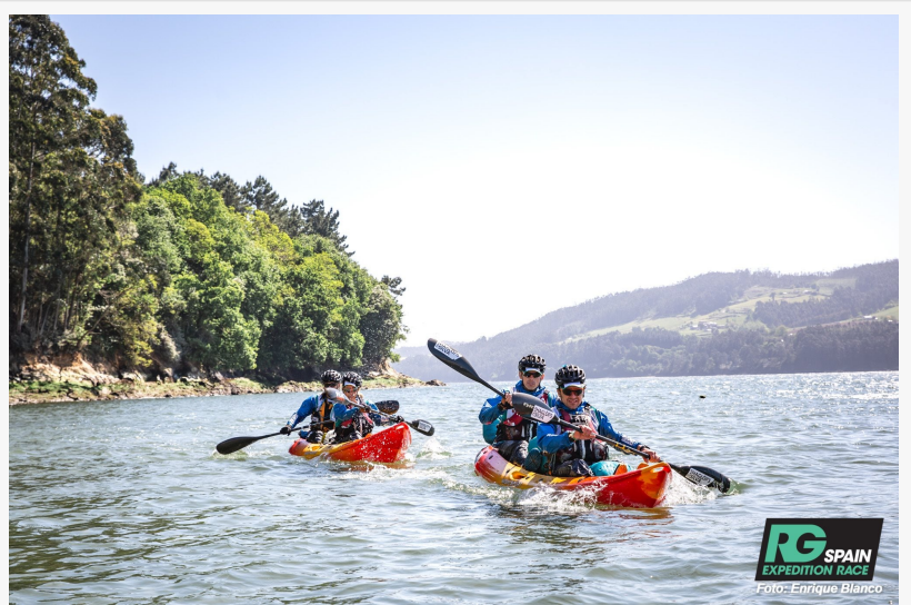
Kayaking at Raid Gallaecia in Spain

For more information see https://raidgallaecia.com and follow the race on; https://www.facebook.com/RaidGallaeciaExpeditionRace https://www.instagram.com/raidgallaecia/