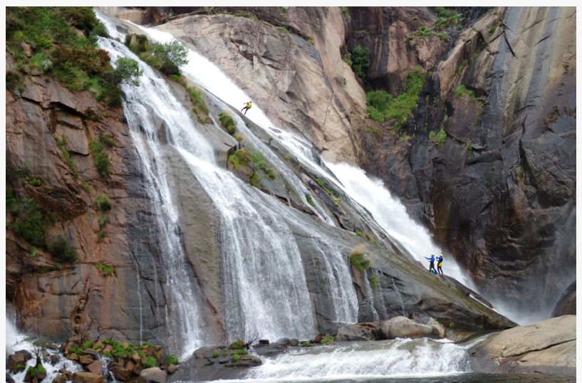
Canyoning will feature in Raid Gallaecia 2025