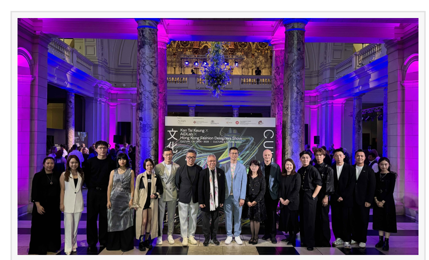
The 'Kan Tai Keung X AiDLab X Hong Kong Fashion Designers Show', organised by AiDLab is taking place on 17th July at the Victoria & Albert Museum in London.

LONDON, UNITED KINGDOM, July 24, 2024 /EINPresswire.com/ -- The 'Kan Tai Keung X AiDLab X Hong Kong Fashion Designers Show', organised by the Laboratory for Artificial Intelligence in Design (AiDLab) with the Culture and Creative Industries Development Agency (CCIDA) of the Government of the Hong Kong Special Administrative Region (HKSAR Government) as the lead sponsor, is taking place on 17th July at Victoria & Albert Museum in London.