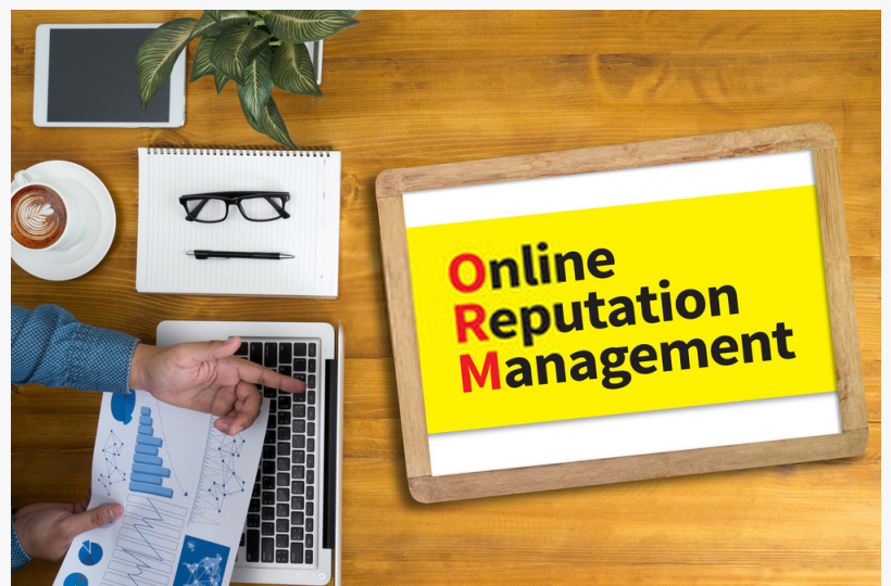
Reputation Management Services