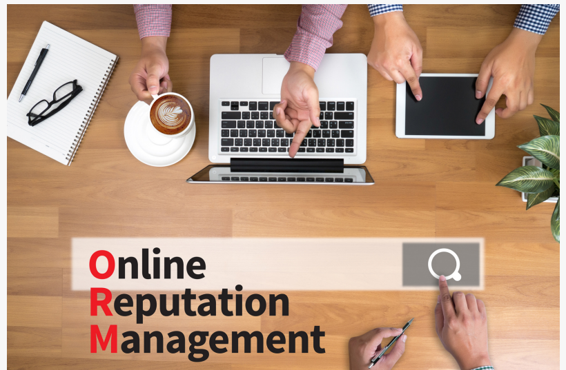
Online reputation management