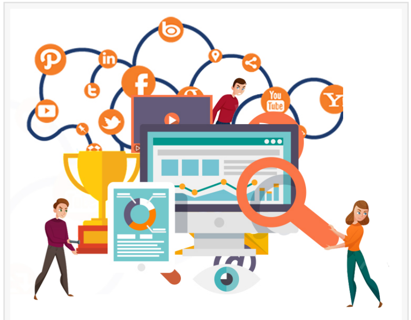
Negative Link Removal Company

Then company need to work even harder to make sure that the business gets success. However, in the age of the internet where people want to share thoughts online, it is possible that some reviews are not that positive. Therefore, Negative Link Agency come in to aid companies from such kind of problems, the ORM professionals of the agency will use some strategies and