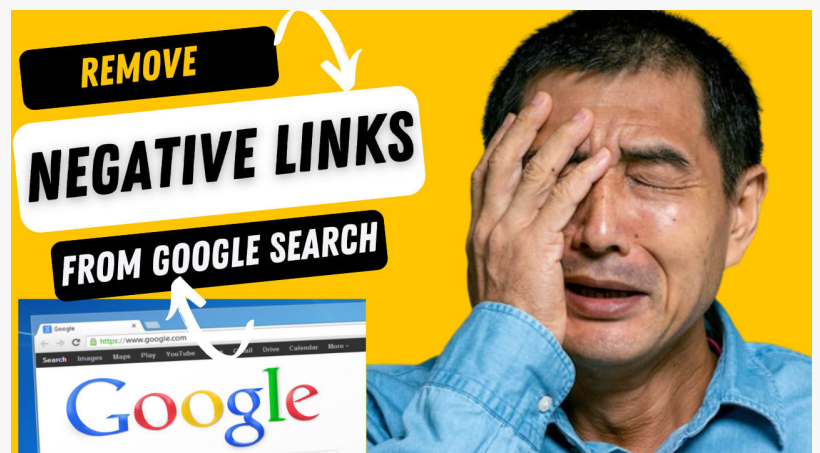
Removing Negative Links