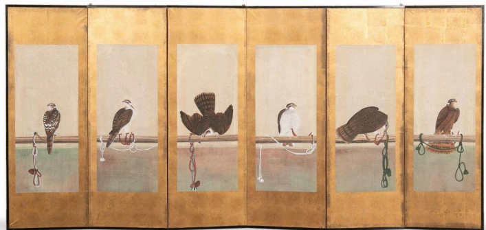
Japanese six-panel byobu screen made in the manner of Soga Chokuan (Japanese ca. 1596-1615), with tethered hawks (or falcons), paint on paper adhered to a gold paper background ($3,025).