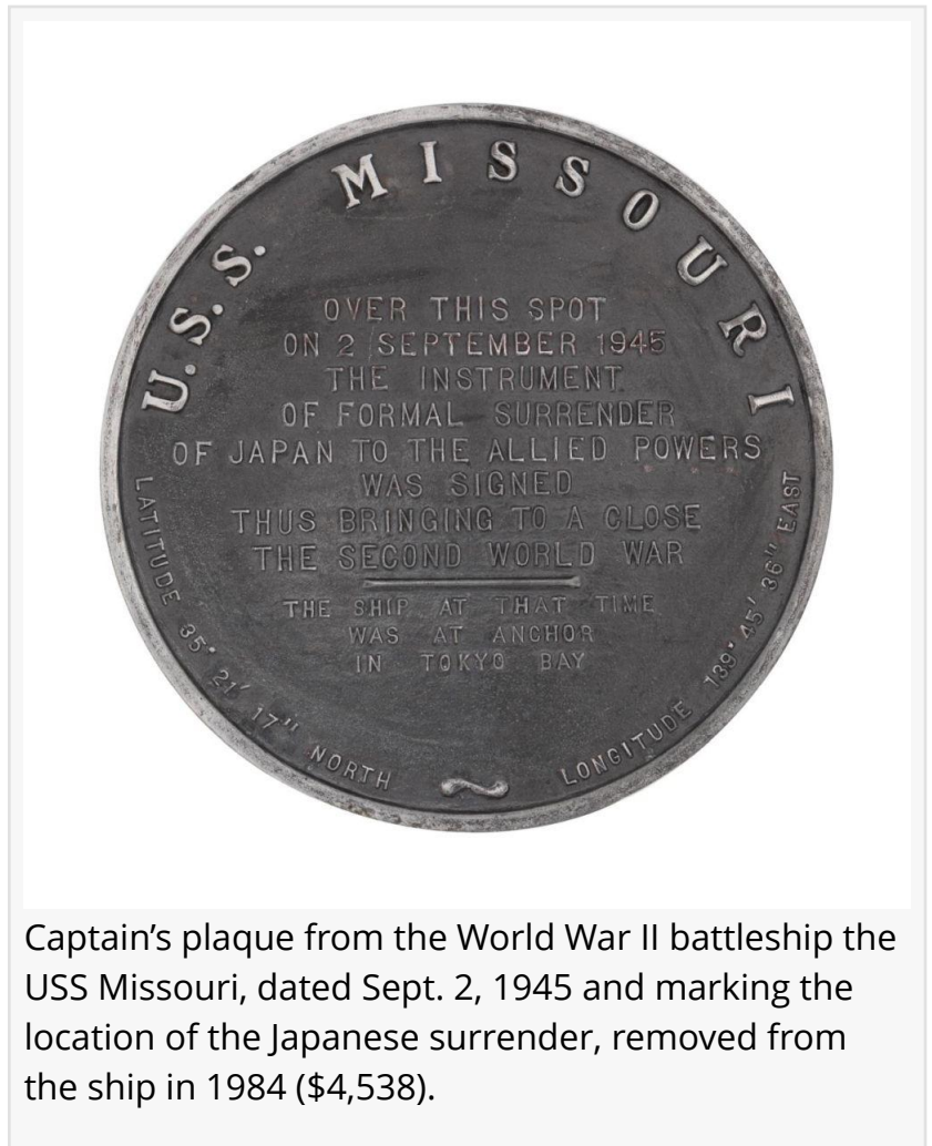
Captain's plaque from the World War II battleship the USS Missouri, dated Sept. 2, 1945 and marking the location of the Japanese surrender, removed from the ship in 1984 ($4,538).

A captain's plaque from the World War II battleship USS Missouri, dated Sept. 2, 1945 and marking the location of the Japanese surrender, removed from the ship when President Reagan formed the retrofitted 600-ship navy in 1984, achieved $4,538. Also, 1936 Berlin Olympic Games scrapbook containing a Jugend Ehrendienst sleeve triangle patch in blue with Olympic rings above 'Jugend Ehrendienst' in yellow, plus five pencil autographs from various Olympic athletes, fetched $2,722.