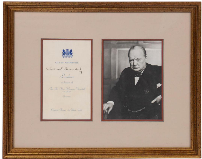
1946 luncheon notice from the city of Westminster, England, given in honor of Winston Churchill and signed by him, nicely framed and with a photo of Churchill ($4,538).

Several strands of George Washington's hair, a piece of cloth from his personally worn vest, and