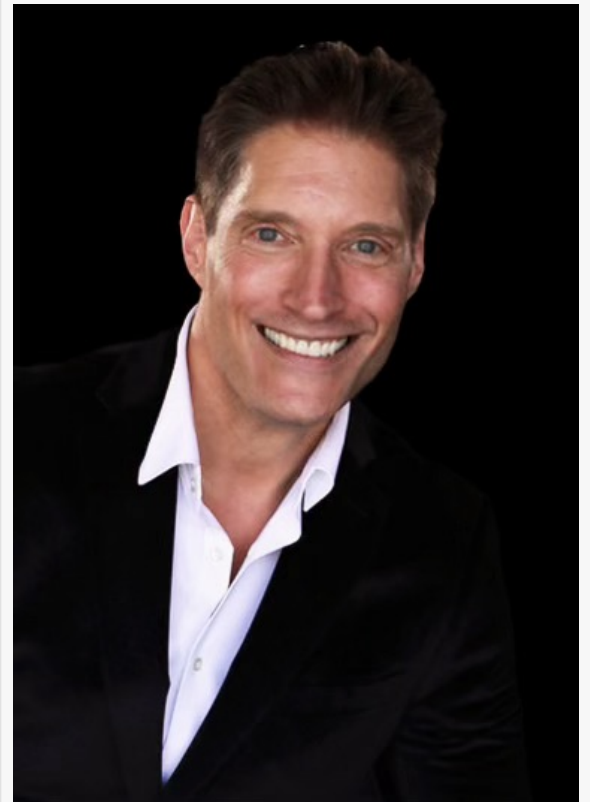
Sean Kanan, Actor/Producer

Sean Kanan's website: https://seankanan.actor/