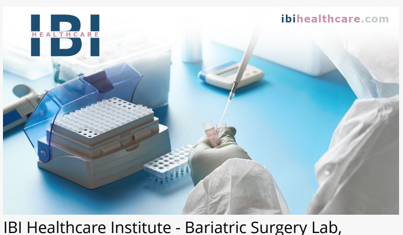
IBI Healthcare Institute - Bariatric Surgery Lab, Georgia and Florida

receive top-notch care without unnecessary hassle. That's why IBI now offers these lab tests. As a result, the patients don't need to visit other facilities for follow-up tests. Additionally, these tests are now available at IBI weight loss clinics: