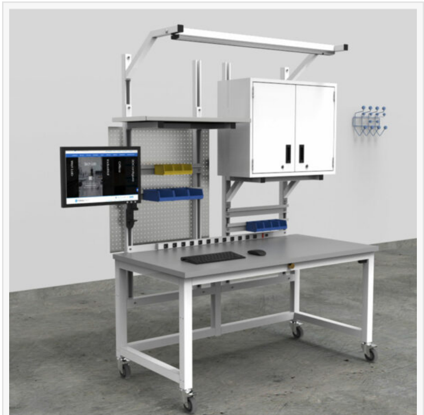
The modular steel workbench shown above features an ESD worksurface to protect sensitive microelectronics.

Educators need to quickly come up to speed on the ethical implications of using AI technologies in the classroom and deliver a unified message to students about what is expected and what is not. (In many states, legislators are already stepping into the void, enacting new laws regulating AI in the classroom.)