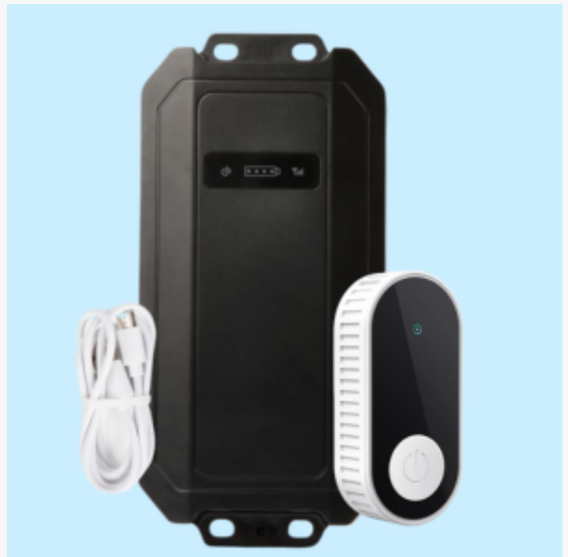
GPX's ChargeTrack + TempTrack pairing, the "ChargeTemp" bundle