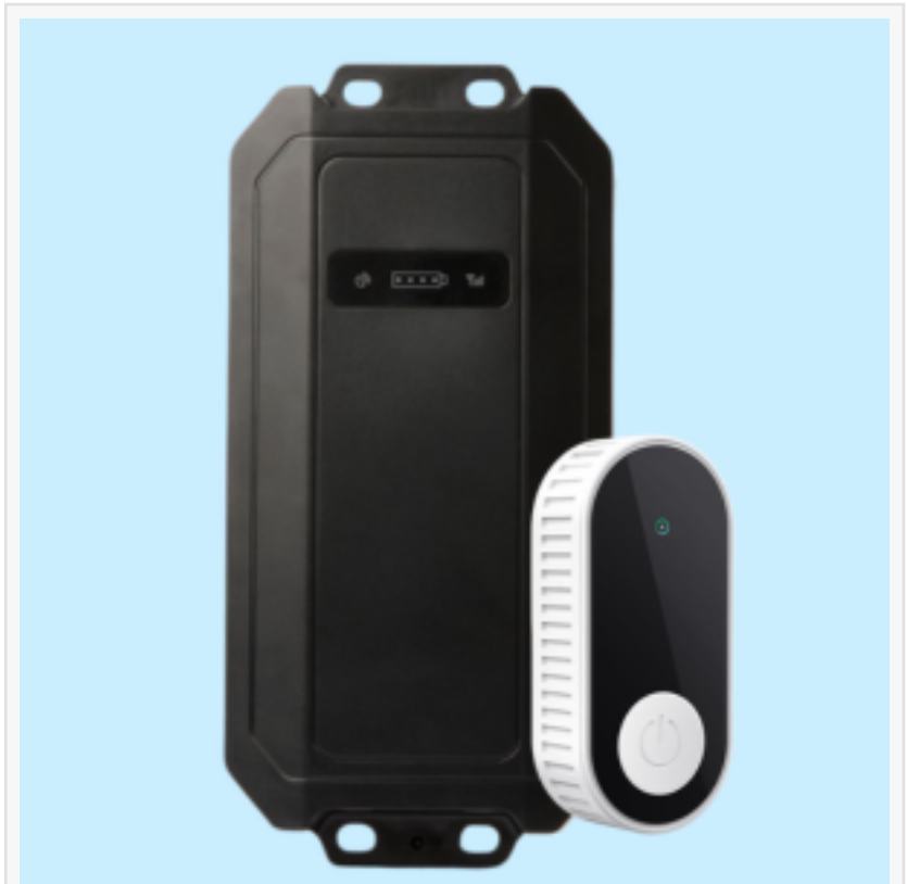
GPX's AssetTrack + TempTrack pairing, the "AssetTemp" Bundle

In the healthcare space, TempTrack helps managers ensure medical supplies and pharmaceuticals are stored within safe temperature and humidity ranges. Additionally, in the logistics industry, TempTrack helps