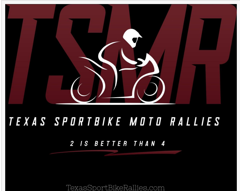
Texas SportBike Moto Rallies