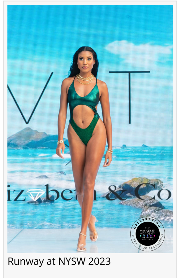
Runway at NYSW 2023