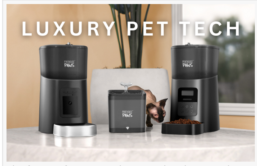
The future of pet care is here - and it's luxuriously high-tech.

This press release can be viewed online at: https://www.einpresswire.com/article/730421590