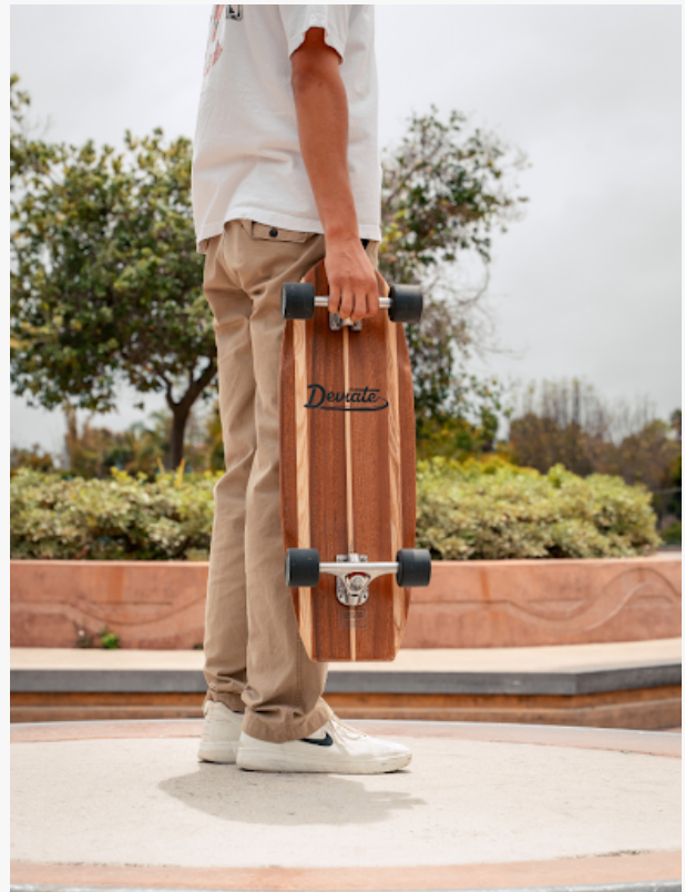
Deviate Board Co Crafts Unique Longboard Skateboards with a Surf-Inspired Twist