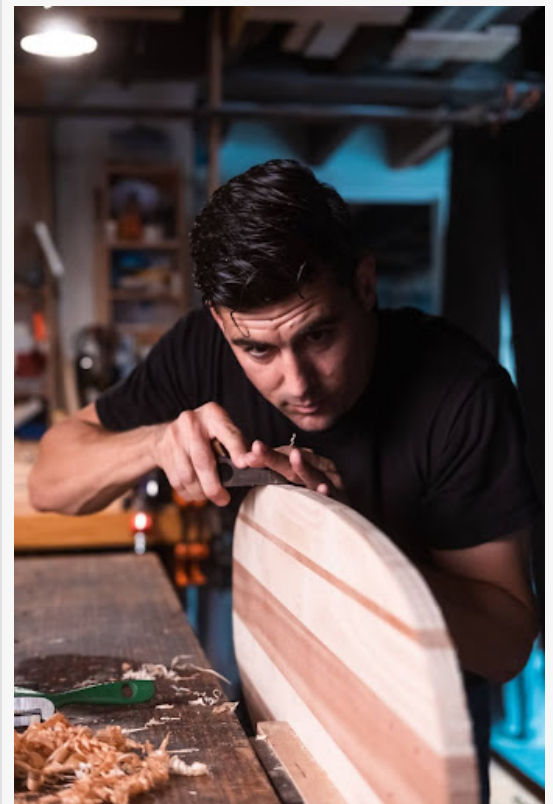
Fine tuning the rail profile on an L-Train.