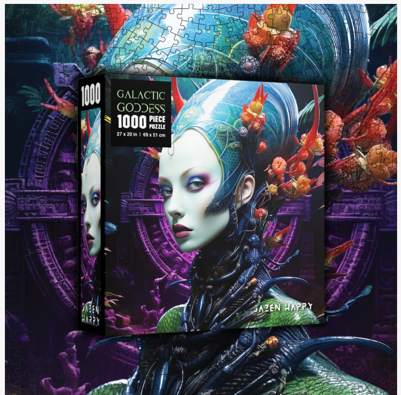
Galactic Goddess, 1000 piece, Jazen Happy Jigsaw Puzzles