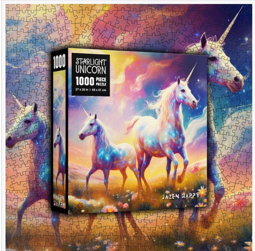
Starlight Unicorn, 1000 piece, Jazen Happy Jigsaw Puzzles