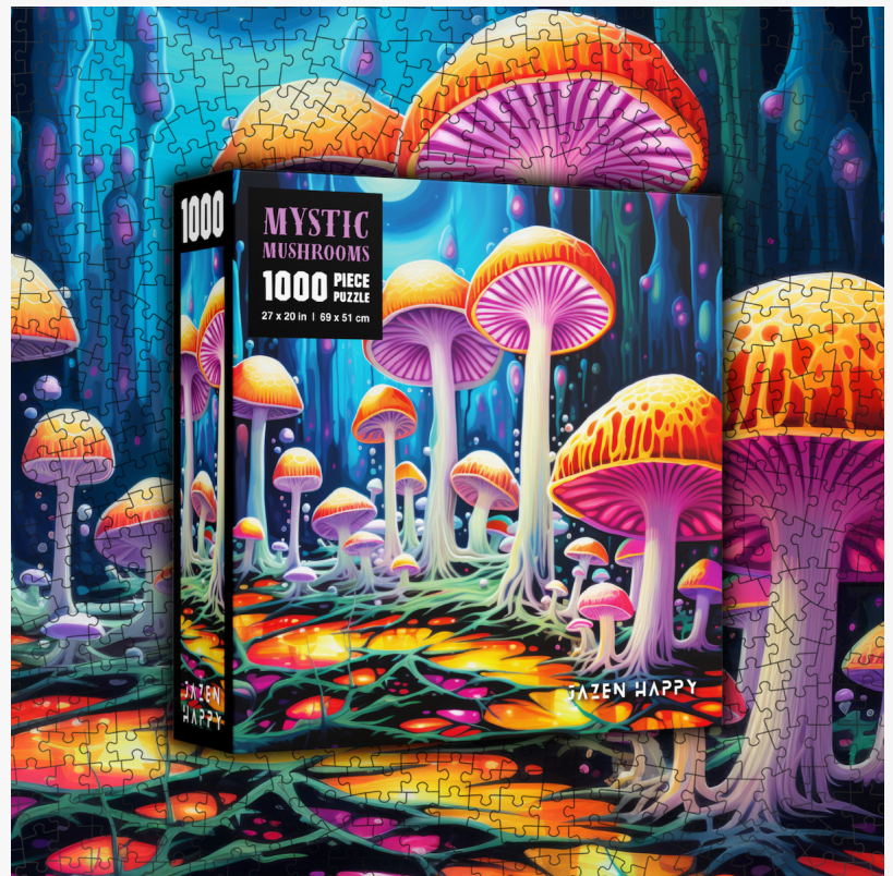
Magic Mushrooms, 1000 piece, Jazen Happy Jigsaw Puzzles