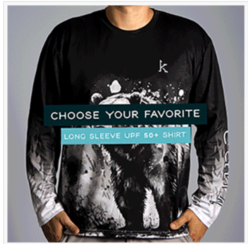
First Edition Complete Collection GIF

Kuna Sportswear's launch introduced a new era of adventure-driven apparel. Now, with the Kickstarter campaign, the brand aims to expand its reach and build a community of outdoor enthusiasts who value both functionality and style. The campaign will provide detailed information about the product's features, the unique designs available, and the exclusive discounts for backers.