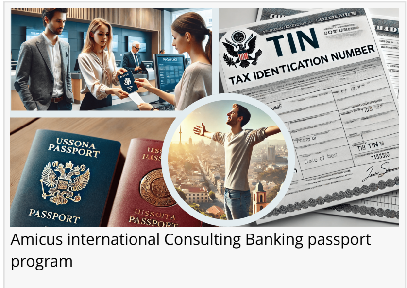
Amicus international Consulting Banking passport program

The TIN is indispensable for maintaining transparency and legality in financial affairs. It ensures that all income and financial transactions are declared and managed according to international tax regulations, thus preventing potential legal issues arising from undeclared income or assets.