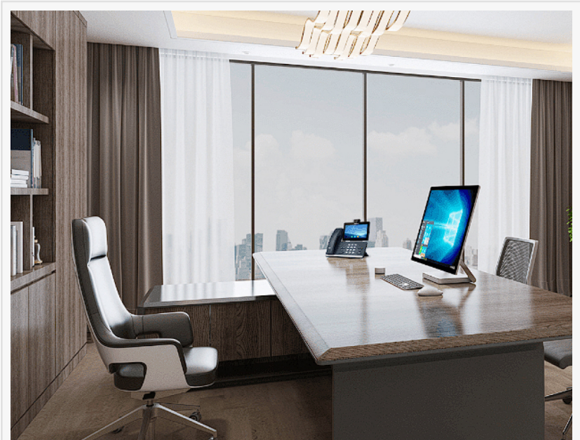
High Quality YeaLink Desktop VoIP Phones

SoundCurve's VoIP telephone service is distinguished by its ease of use, affordable pricing, and comprehensive features. Each phone arrives pre-programmed and ready for immediate use. Simply connect your phone to the internet and start making calls or using advanced