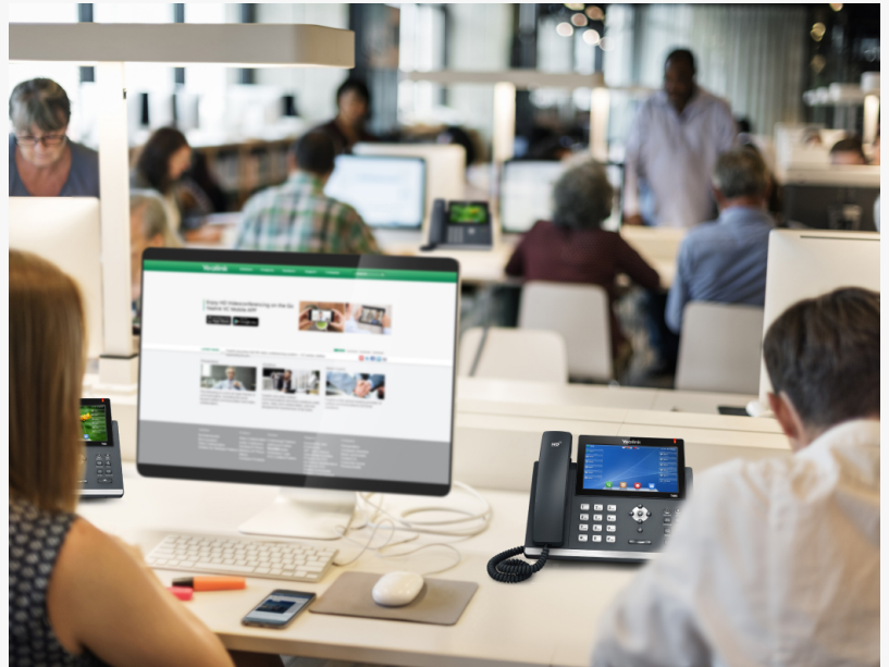
Call Center VoIP Phones