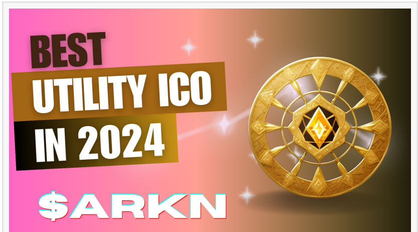
Problem & Solution of Arkenstone & Gemlaunch Suite