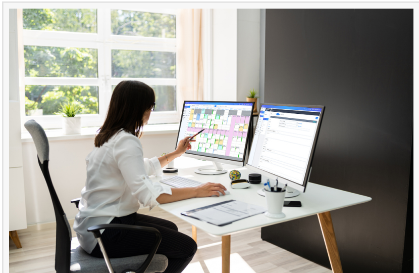
Professional healthcare management made simple with Power Diary.

BALLARAT CENTRAL, VIC, AUSTRALIA, July 29, 2024 /EINPresswire.com/ -- Power Diary, a leading practice management software for allied healthcare practitioners, is pleased to announce the launch of its new pricing structure for accounts worldwide. Effective now, this simplified pricing reflects an understanding of the needs of new and established health practices.