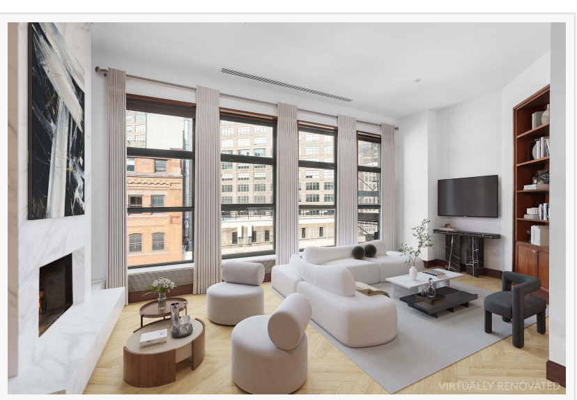
11 Vestry Street, PH, Tribeca, New York City, New York

The auction is the latest New York buying opportunity following a series of high profile auctions within the state. Earlier this year the firm sold 'La Dune', an iconic Hamptons dualproperty estate that sold for an