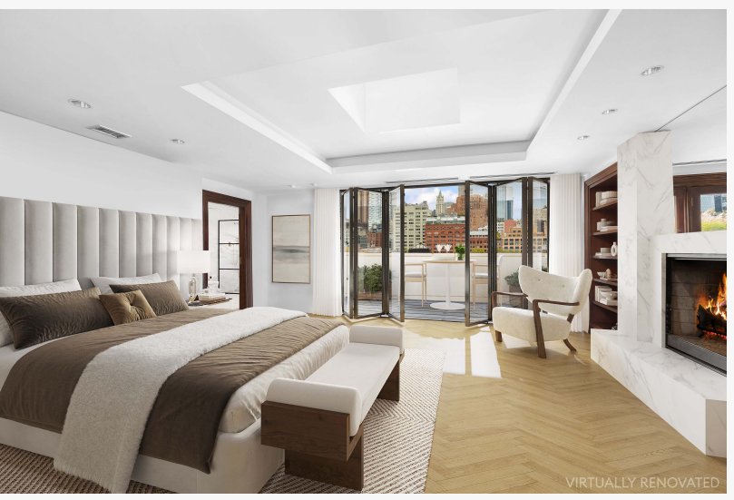
Opulent three-story Tribeca penthouse with private elevator

Located at 11 Vestry Street in Manhattan's celebrated TriBeCa neighborhood, the three-story penthouse offers 3,300 square feet of interior living space, complemented by an additional 2,000 square feet of outdoor terraces. The residence features four bedrooms, three full bathrooms, and luxurious living areas including a unique custom water feature and dramatic floating staircase. Representing a rare opportunity to acquire a premier penthouse in this sought-after neighborhood, the penthouse showcases unparalleled