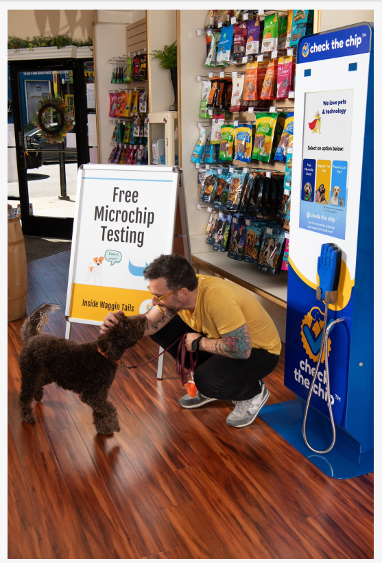
Check the Chip's first kiosk inside the Waggin Tails Pet Store, Los Altos, CA

The kiosk instantly performs a database application search to help a registered lost pet back home. If the pet is registered, the pet's owner will receive an SMS message to their listed contact number and the location of the kiosk along with the contact information of the Good Samaritan. This seamless method eliminates all