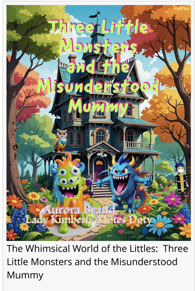
The Whimsical World of the Littles: Three Little Monsters and the Misunderstood Mummy