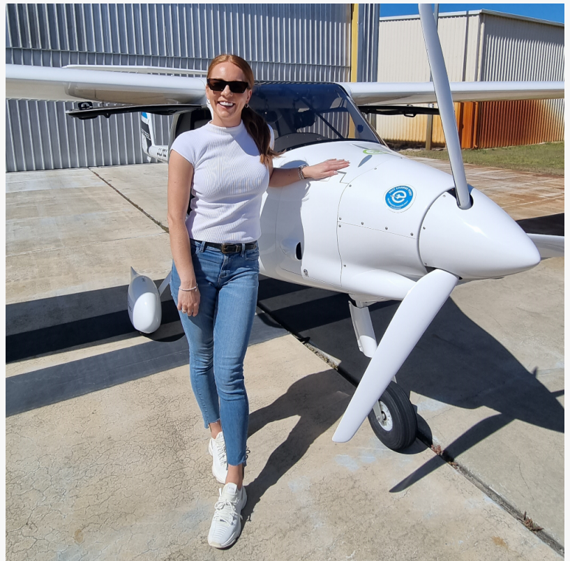
More women are choosing to fly electric for a more future-focused Pilot training journey